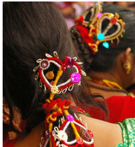
Traditional hair ornaments for a festival