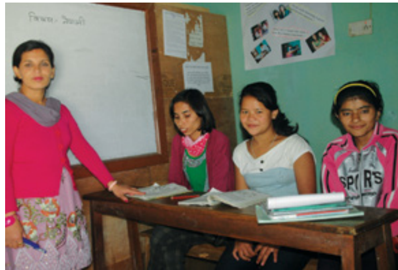
A class at Jeevan Jyoti School.