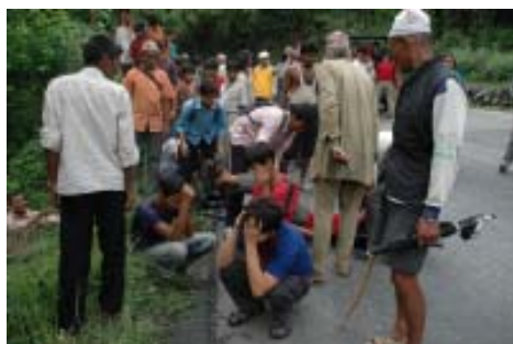
Students and public during road accident simulations in Dhading highway

UMN's Dhading Cluster Team has made good progress with government and community stakeholders and partners in improving the district's disaster management situation. One of its main partners is Committed Society for Change in Nepal (COSOC).