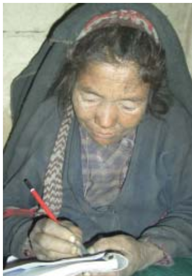
It is never too late to learn how to write or read as this woman from Mugu demonstrates.

They had to cross a large river with no bridge, only a metal 'zip-line' which has to be negotiated on a bit of rope! Having been out to visit the facilitators and observe their classes the previous week we understood the difficulty of their journey!